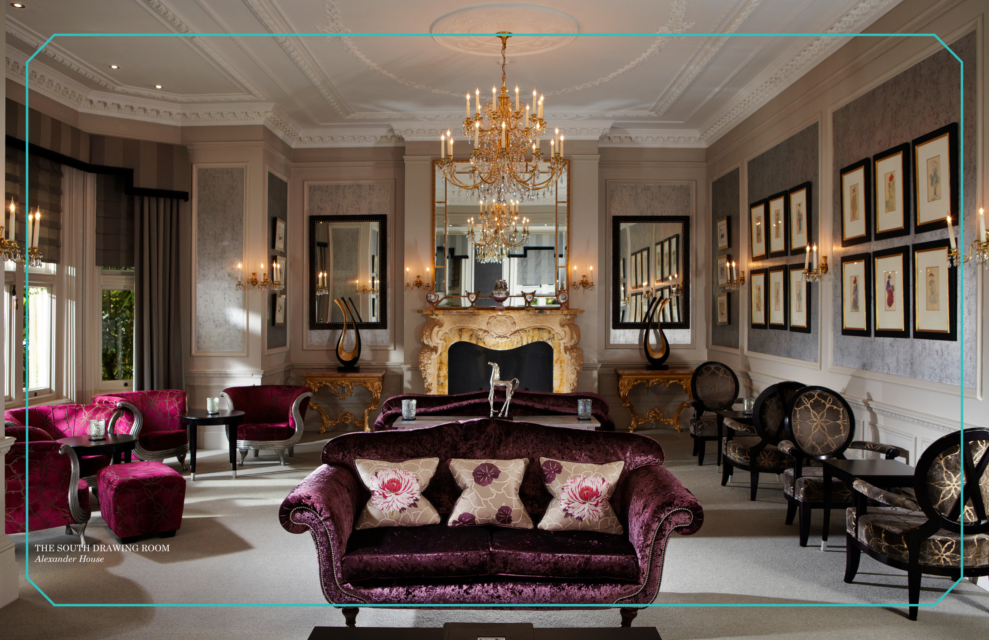
THE SOUTH DRAWING ROOM Alexander House