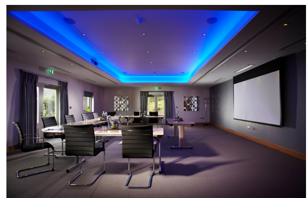
CLOCKWISE FROM TOP LEFT: A Master Suite, RG's Restaurant, the Gardens, The Pavilion meeting room, afternoon tea by the fire in Elements and the indoor pool at Utopia Spa.